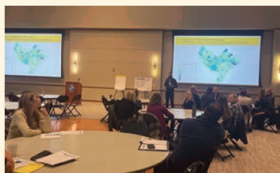
Images from Stakeholder Workshops